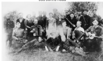
Jewish partisan music group in Belorussia, 1943